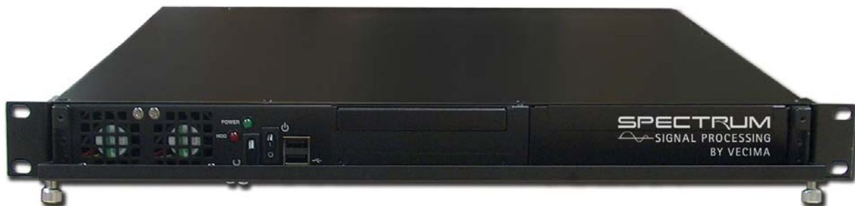
Figure 3. Front view of a SDR-4000 Value Starter Kit in 1U Rackmount chassis